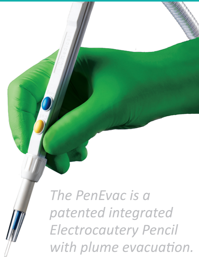
The PenEvac is a patented integrated Electrocautery Pencil with plume evacuation.

The PenEvac electrode and plume collection nozzle can be adjusted by the surgeon to any length between 1.5” and 6.5”. This eliminated the need for replacing different length electrodes and plume collection nozzles during surgery. It has the highest airborne particle reduction when compared by an independent test to any other plume collection device.